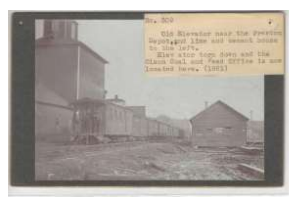
Both photos are likely the McMichael elevator built in 1879.

Fillmore Street from the bridge just west of the Fairgrounds and shows the other elevator south of Fillmore Street