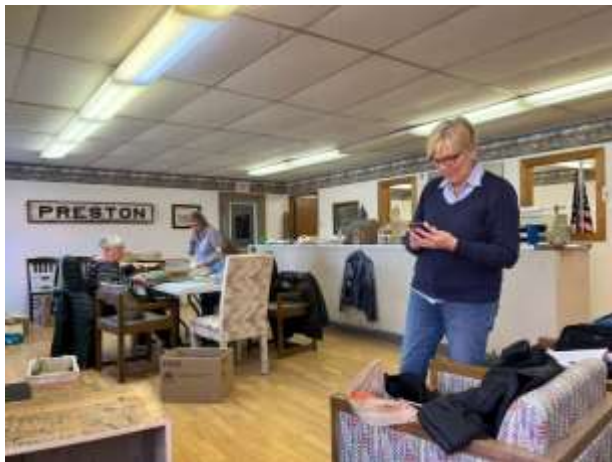
The Collections Committee at Work